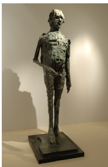
César – Hommage à Léon – 1964 – Bronze – 242 x 104 x 68 cm

Evsá Model sublimates the loneliness of being, while Penck strives to find the equation for it. More recent artists rather choose to encapsulate the being in a detail, either enlarged and pixellated as with Claude Cortinovis, or endlessly scrutinized as in Marcela S. Nelson's miniature portraits.